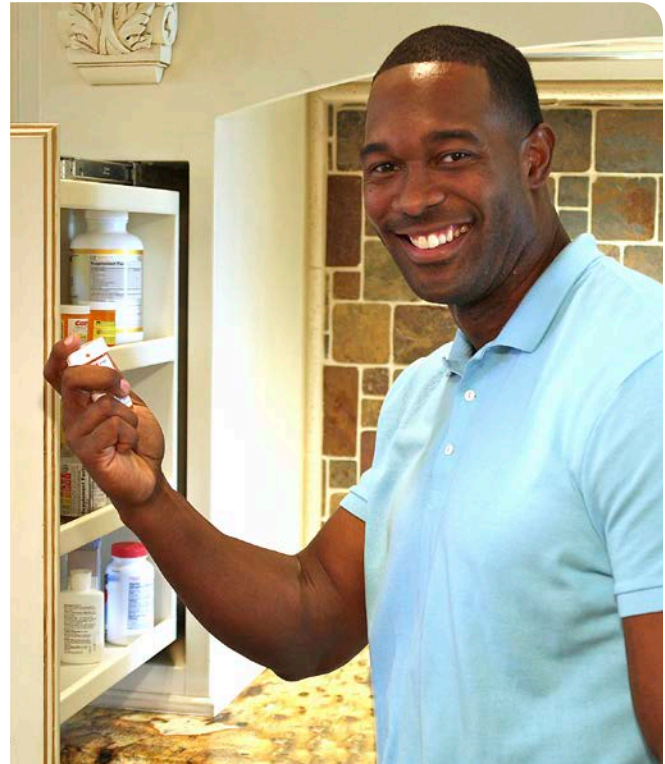
Taking your medicine the way your doctor tells you to is key to getting your blood pressure down where it belongs!

Your doctor has prescribed medicine to help lower your blood pressure. You also need to make the other lifestyle changes that will help reduce blood pressure, including: not smoking, reaching and maintaining a healthy weight, lowering sodium (salt) intake, eating a heart-healthy diet including potassium-rich foods, being more regularly physically active, and limiting alcohol to no more than one drink a day (for women) or two drinks a day (for men). Following your overall therapy plan will help you get on the road to a healthier life!